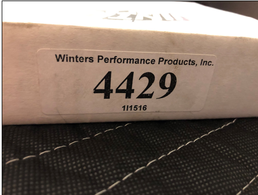
Figure 3 – Winters performance gear set part number; 44xx is format, xx represents the actual gear set number – gear set #29 shown here