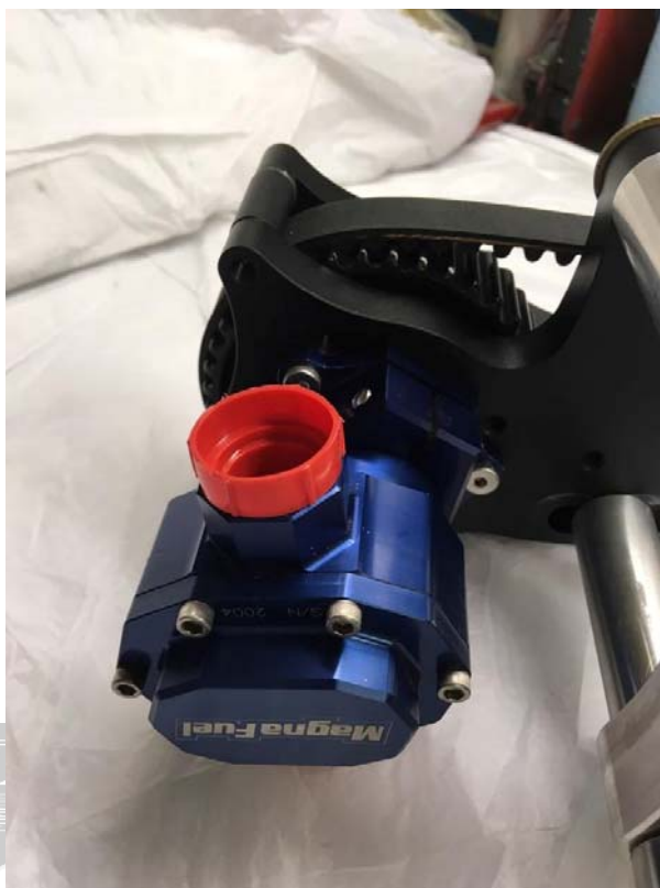
Rear view, fuel pump installed