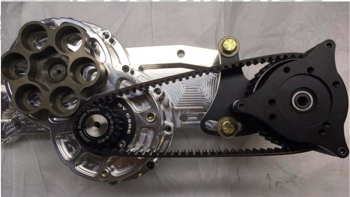
Front view of dual drive to X-10, front pump pad open